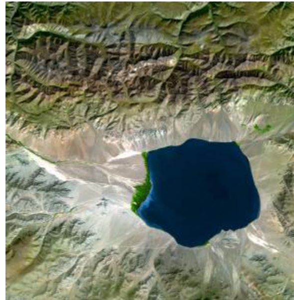
Figure 2: Extraction of object using Active Contour Method

Where E_{con}(v_i) is the continuity energy that enforces the shape of the contour and E_{bal}(v_i) is a balloon force that causes the contour to grow (balloon) or shrink. ‘c’ and ‘b’ provide the relative weighting of the energy terms.