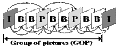
Figure 1: Prediction encoding of MPEG-4, GOP (N=9, M=3) (from CH-Lin et al [3])

predictive-coded) frame. The MPEG I frame is an independent frame which means both its encoding and decoding is said to be independent which means that it can be coded as a still image, with no relationship to any of its previous or successive frames. The P frame is however said to be dependent on its preceding I or P frame. Encoding P frame uses prediction from the preceding I or P frames in the video sequence. Therefore the P frame requires the information of the most recent I frame or P frame for encoding and decoding. The B frame is dependent on the preceding and succeeding I or P frames. It is encoded using predictions from the preceding and succeeding I or P frames. According to the coding relation, in MPEG-4 video stream the most significant video type is the I frame, with the P frame being more important than B frame [3].