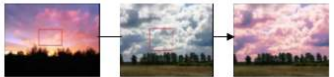
Figure 1 : (b) Partial image recoloring with an image fragment using proposed method.

Figure 1(a) shows the effect of global color transfer in which the whole image gets affected while figure 1(b) shows the partial image recoloring which is nothing but a local color transfer. Here the user just have to select a pair of corresponding regions in the source and target image for the color change. The data of the selected region is used to calculate its color statistics. We use them to estimate pixels of the target image belong, or rather are close enough, to the selected color range. Then color transformation is applied to the image, according to this estimation. In this paper a novel approach towards the software implementation of the local color transfer algorithm is proposed.