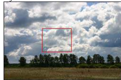
Figure (2): The region is selected to correct the sky.

At first user has to select an object to correct at the target image. This can be done by loosely selecting a rectangular region of the object that needs correction. There's no need to select the region precisely close to the edges of the area, that user wants to correct, because we will use its color range without spatial characteristics. The only limitation is that the whole region must be inside this object.