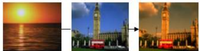
Figure 1: (a) The effect of total image recoloring using the method of Reinhard et al [1].

easily exaggerated which will cause unnatural and saturated result. Later to overcome problems associate with global color transfer local color transfer methods have been proposed for application to specific local regions within an image. In this case, the user can select a pair of corresponding regions in the source and target image for the color change.