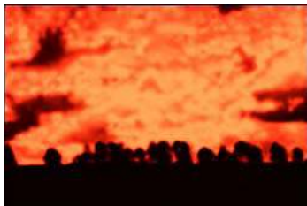
Figure (3): CIM for the selected region from Fig. 2 using (5).

F(x) is not strictly defined in (4), because there can be used various functions. Our experiments have shown that for photographs of good enough quality better results can be achieved using: F(x) = e^{-3x^2} (5)