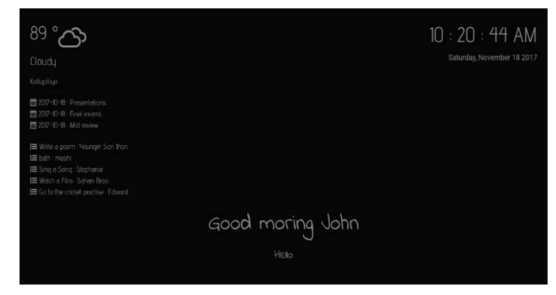
Figure 6: Virtual Interface of the Mirror

Main objective of this project was to present a system which is fully functional and covers colors, designs, words, and to encourage children activities. The use of the system could happen in any geographical area. So, the child will be performing actively with interest and pleasure.