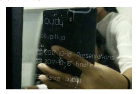
Figure 5: Real Mirror Interface