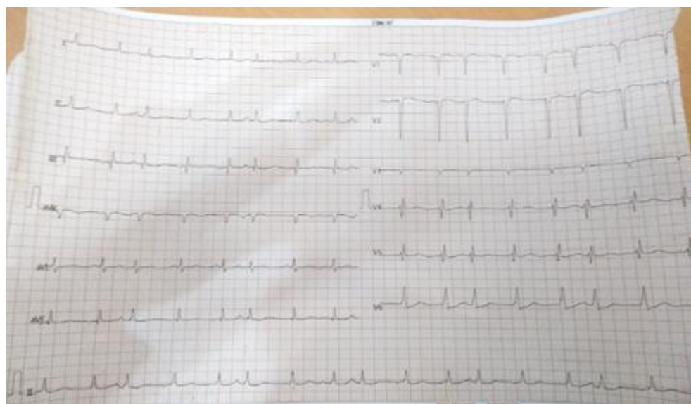
Fig. 1.3: Electrocardiogram after treatment

After treatment with intravenous magnesium of 2 gm stat given over 5 minutes. The patient was then followed by 4 gm intravenous infusion over 24 hrs and the dose was repeated as necessary to main the plasma concentration above 1 mg/dl. Patient’s reduced renal functions were taken into consideration while treating the patient. The patient seems recovering within minutes and the Spiked Helmet pattern in the patient’s electrocardiogram disappears as is clearly visible in Fig. 1.3.