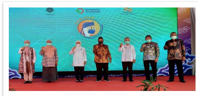
Figure 1.1 Inauguration of MANG COVID Program by Minister of Manpower RI