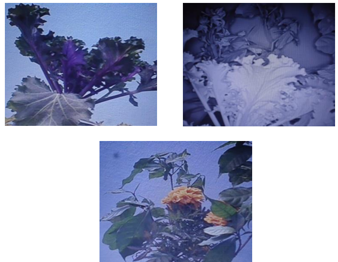
Fig. 2 Different textures of plants

Approaches to texture analysis giving useful information for enhancement are usually categorized as structural, statistical, model-based, and transform methods based. Structural approaches represent texture by well-defined primitives (micro texture) and a hierarchy of spatial arrangements (macro texture) of those primitives. The advantage of the structural approach is that it provides a good symbolic description of the image; however, this feature is more useful for synthesis than analysis tasks. In contrast to structural methods, statistical approaches do not attempt to understand explicitly the hierarchical structure of