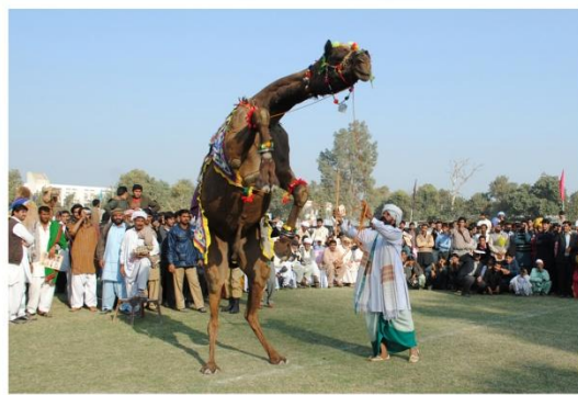
(fig 15-16-17-18 Camel Dance in Cholistan, Southern Punjab, Pakistan)