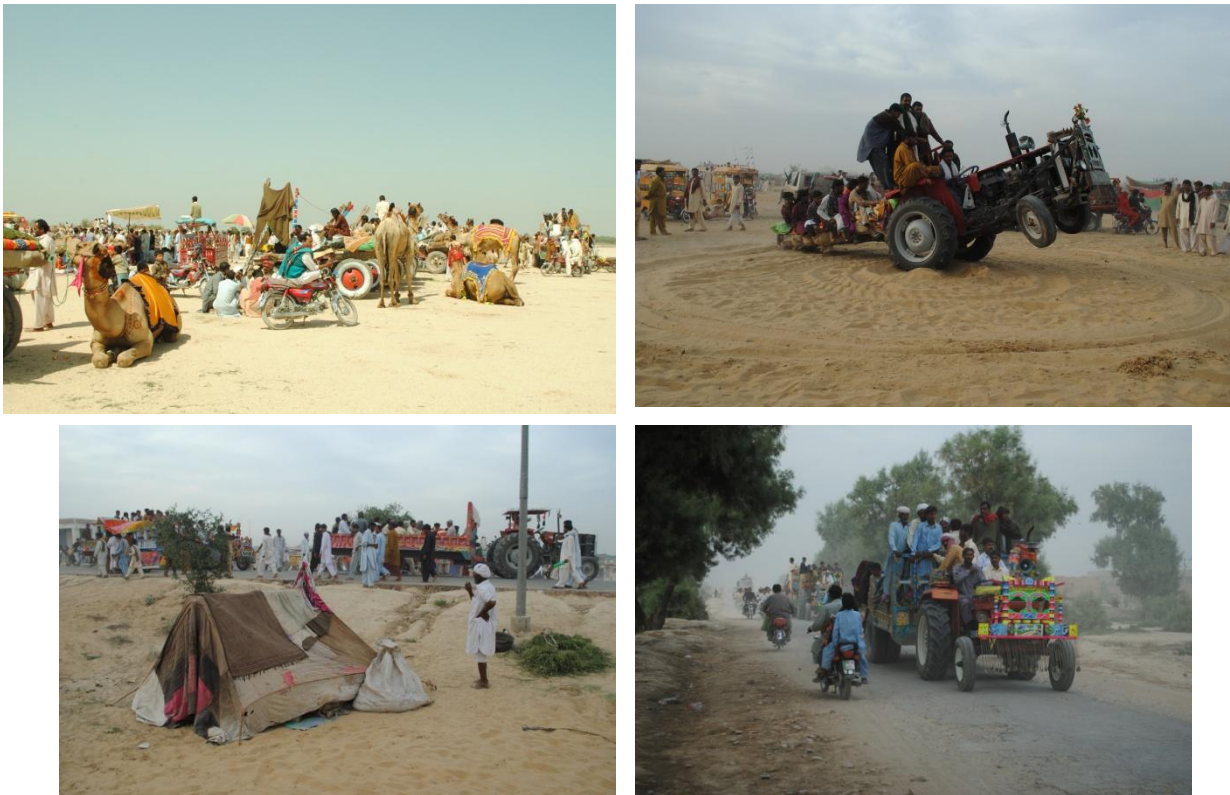
(fig 7-8-9-10 Channan Peer Urs, Southern Punjab,Pakistan)

Camel journey: Camel journey is the famous festival of the Cholistan Desert in which two or more camels run in a specific distance. Camel journey are the ideal way to spend time exploring rustic Thar and Cholistan. A camel journey moves through the golden sands of the savage.No, fixed time for this event but people of the Cholistan are decided before the Channan peer Urs in every year. Here, Camel Safari is also organized in this area time period of camel safari is (9days,12days).Some photographs of this event are such as: