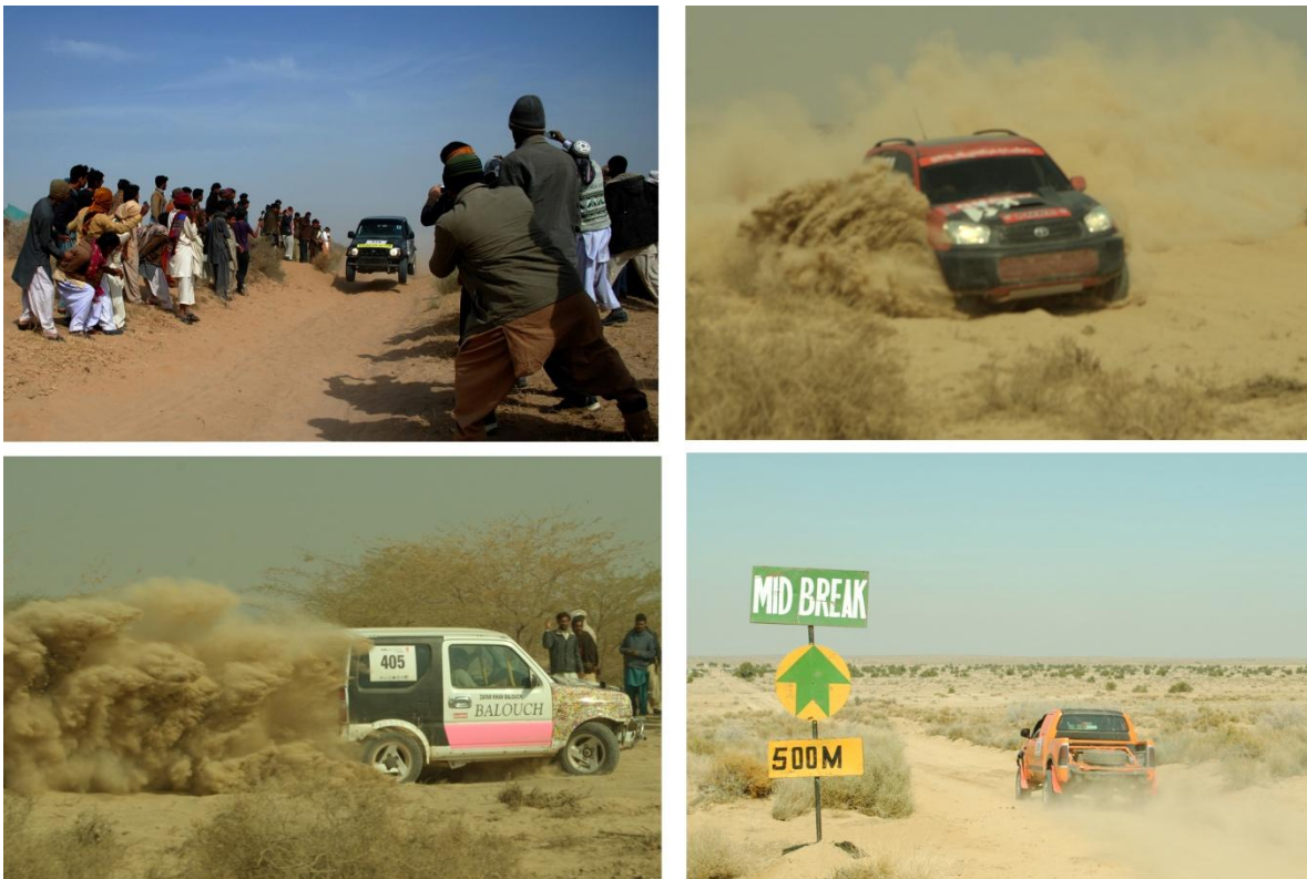
(fig 36-37-38-39 Cholistani Jeep Rally, Southern Punjab,Pakistan)

Jeep Rally: is known as Cholistan Jeep Rally. TDCP Cholistan Jeep Rally is a rally raid type of off-road race , organized by the TDCP in Pakistan . The event is annually run in the Cholistan Desert venue. It was first introduced in 2005 by Tourism Development Corporation of Punjab (TDCP). The event is run by the Government of Punjab . The rally holds near the Derawar Fort in Bahawalpur . Above 100 drivers and teams from all over Pakistan participate in the jeep rally and about 100,000 visitors witness the jeep rally every year. The rally is held almost in Feb month. It is a big cultural event of southern Punjab of Pakistan. Some shots are given below like as: