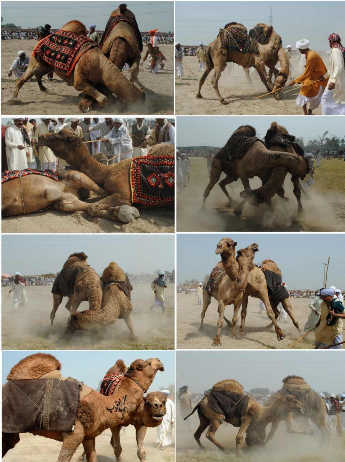
(fig 19-20-21-22-23-24-25-26 Camel Fighting in Cholistan, Southern Punjab, Pakistan)

Camel Fighting: Camel fighting originated among the different districts of Pakistan especially Cholistan tribes and is considered part of Cholistan culture. This festival is held in these areas of Cholistan like Fatuwali near Sama Satta Bahawalpur, Lattan Singhar, Feroza near Rahim Yar Khan, Kanda Fareed Cholistan, Liaquatpur, Derawar Fort, and Marrot etc. There are some photographs of this event like as: