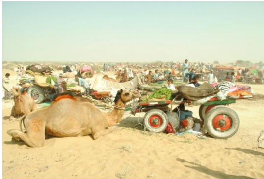
(fig 3-4-5-6 Channan Peer Urs, Southern Punjab,Pakistan)