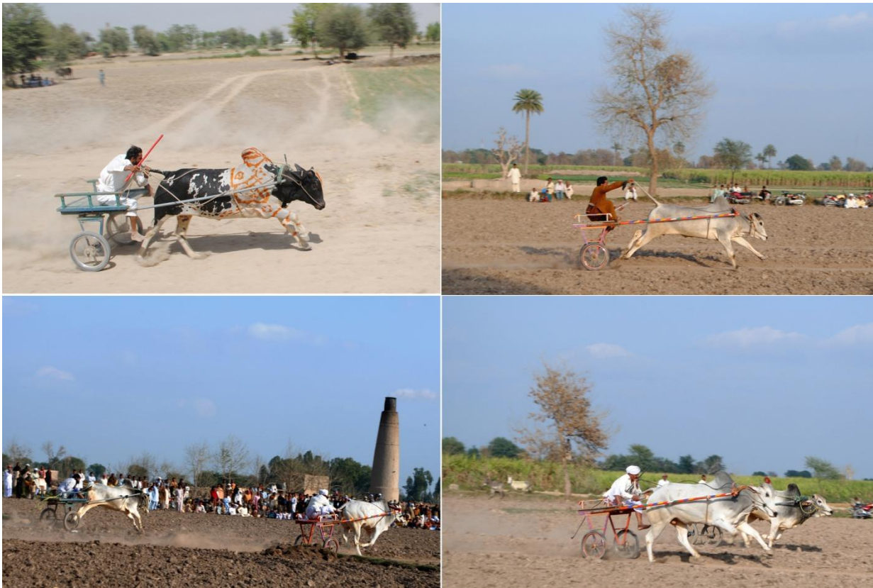
(fig 27-28-29-30 Bull Cart Race in Cholistan, Southern Punjab, Pakistan)

Bull Cart Race: A bull cart or ox cart is a two-wheeled or four-wheeled vehicle pulled by oxen . It is a means of transportation used since ancient times in many parts of the world. They are still used today where they also used for running in cultural festivity like as: