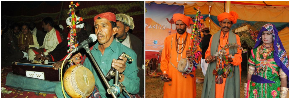
(fig 34-35 Cholistani Folk Music, Southern Punjab,Pakistan)

Cultral Night: It is also organized in different parts of the Cholistan. People of the Cholistan sing and enjoy full night with the pure Cholistani folk music. Especially held during Jeep Rally event and Channan Peer Urs etc like as: