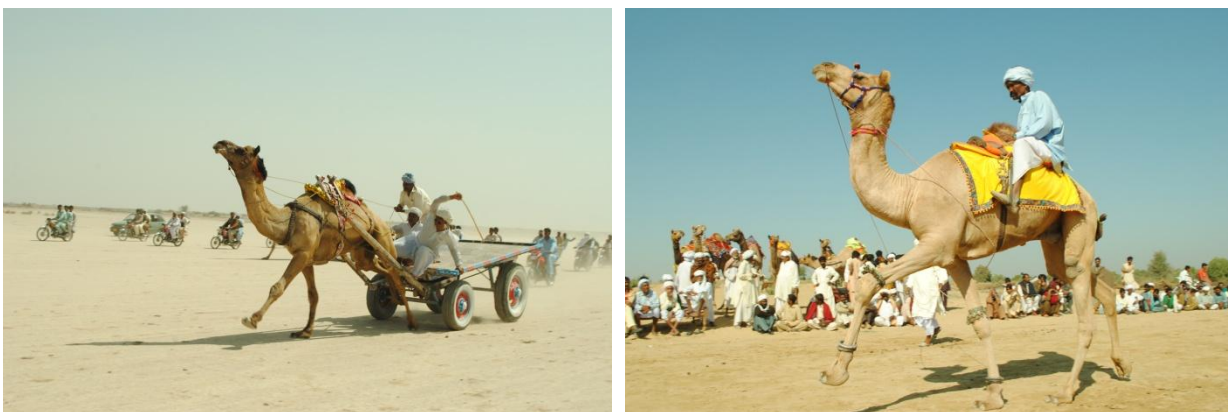
(fig 11-12 Camel Journey/Ranning, Southern Punjab,Pakistan)

Camel journey: Camel journey is the famous festival of the Cholistan Desert in which two or more camels run in a specific distance. Camel journey are the ideal way to spend time exploring rustic Thar and Cholistan. A camel journey moves through the golden sands of the savage.No, fixed time for this event but people of the Cholistan are decided before the Channan peer Urs in every year. Here, Camel Safari is also organized in this area time period of camel safari is (9days,12days).Some photographs of this event are such as: