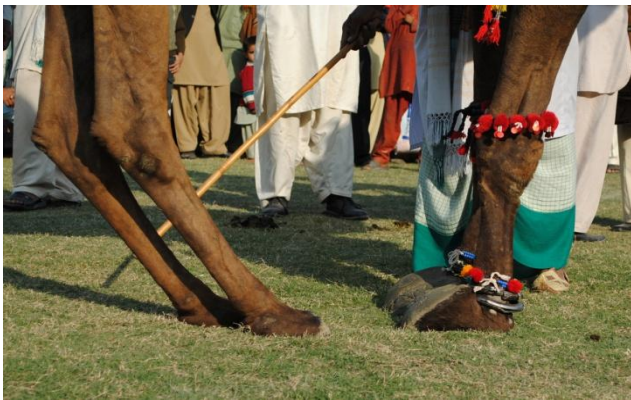
(fig 13-14 Camel Dance in Cholistan, Southern Punjab, Pakistan)