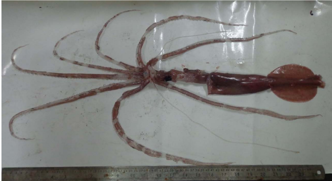
Fig. 2. Asperoteuthis acanthoderma specimen collected from Arabian Sea.

deteriorated condition, detailed analysis of internal anatomy of the sample could not be conducted. The presence of nidamental gland shows this is a female species (Fig. 3).