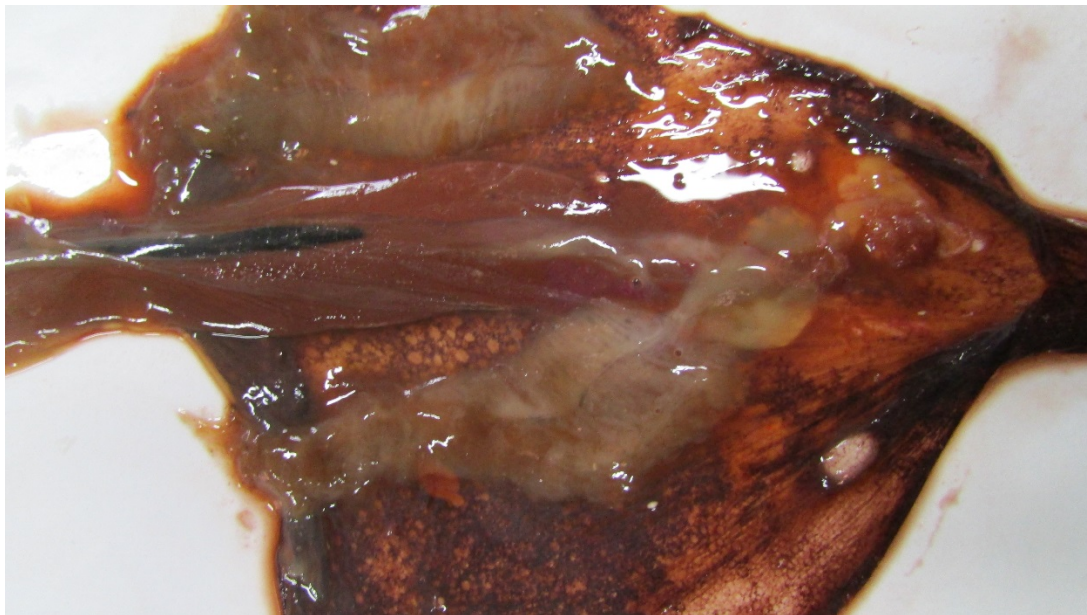
Fig. 3. Internal organs of the specimen collected from Arabian Sea

deteriorated condition, detailed analysis of internal anatomy of the sample could not be conducted. The presence of nidamental gland shows this is a female species (Fig. 3).