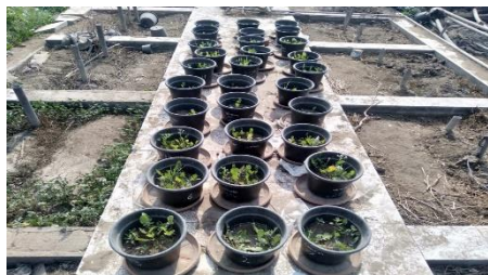
Figure 1. The cultivated plants

In order to test the efficiency of the project, plants were cultivated in the polluted soil after mixing the modifiers with the soil to analyze the physical and the chemical changes that occurred to the plants