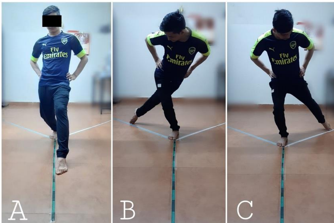
Figure 1: Directions of the Y Balance Test – Lower Quarter. A: Anterior; B: Posterolateral; C: Posteromedial