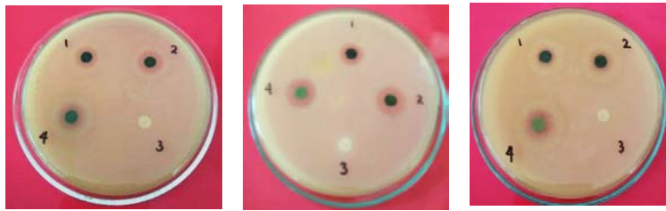
Figure 2. Result of antibacterial activity : (1) Ulva reticulata , (2) Sargassum polycystum (3) Negative control, (4) Positive control. High antibacterial activity was shown by Sargassum polycystum with methanol solvent.

growth of biofilm bacteria by extracts produced by the bioactive composition available in each extract is different. Accordingly, it causes the ability to extract as antifouling differently.