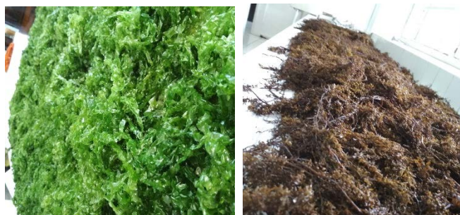
Figure 1. Fresh seaweed from Punaga coast, Takalar. Ulva reticulata (left) Sargassum polycystum (right)

Seaweed that has been taken from Punaga coast is cleaned and washed to remove organisms, mud or sand. After being washed, the seaweed is then weighed as wet weight, as shown in Figure 1 . Seaweed is dried in a shaded place and protected from direct sunlight for 4-6 days and weighed as dry weight. The wet weight of Ulva reticulata is 3250 gram and Sargassum polycystum is 3750 gram. Each seaweed was weight 50 gram to solve in 300 mL of methanol. Percent of dry biomass is 27.73% for Sargassum polycystum and 25.85% for Ulva reticulata , and percent of rendemen for Sargassum polycystum is 2.21% and 2.05% for Ulva reticulata . The highest percent of the crude extract is shown by Sargassum polycystum with methanol extract ( Table 1 ).