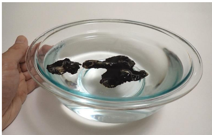
Figure 3. Collected 'pyroplastics' that floats in water.

It has been pointed out that 'pyroplastics' are the source of small plastic particles (microplastics) because it is made physically fragile by combustion (Turner et al., 2019), and it has