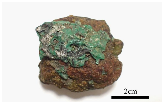
Figure 2. Photograph of 'new plastic formation' collected at the survey site, plastics stuck to a pebble (specimen No.4).

In Japan, environmental pollution by harmful substances like heavy metals and dioxins, originating from the 'hamayaki' (the Japanese name of the act of burning of drifted coastal debris at the shore) of drifting litter that includes high amounts of plastic waste, is seen as the serious problem, and has been reported earlier (Yamaguchi, 2002; Yamaguchi, 2007; Okano et al., 2011). A series of reports of 'new plastic formations', such as 'pyroplastics', have focused on the state of environmental plastics formed via combustion on the problem of 'hamayaki', and it can be said that they have re-focused attention on the issue of marine plastic litter