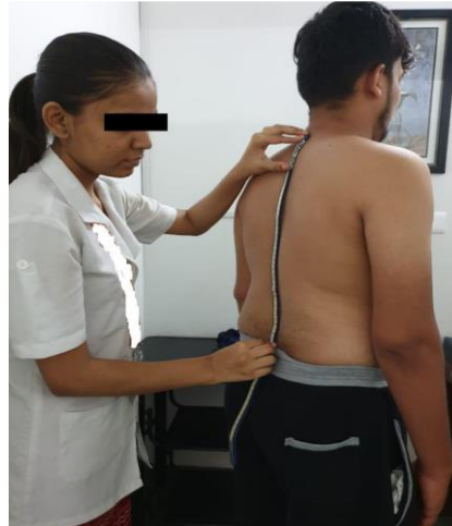
Figure No.4: Measurement of TKI & LLI

b. Assessment of LLI and TKI: The subject was in the relaxed standing position. First the anatomical bony landmarks was mark as C7, T12, L1, S1, and S2 by the examiner. A flexicurve of 60cm is used for the assessment of lumbar spine. This flexicurve was place on the dorsal aspect of the spine i.e. on the spinous process of Thoracic and lumbar spine and shape to fit the contours of these spinal curves. The instrument was carefully remove and trace onto a graph paper. A vertical line drawn to join the C7 and S1 landmarks. Calculation was perform for the kyphosis and lordosis index as