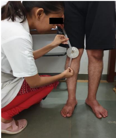
Figure No.3: Q angle measurement