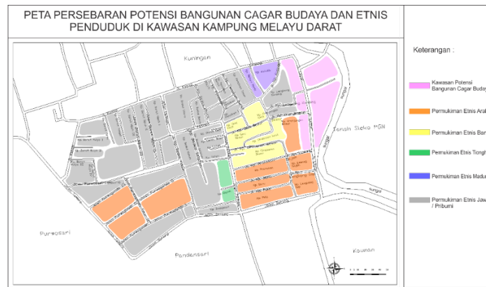
FIGURE 2. Picture of Kampung Melayu Darat

Kampung Melayu Darat was consisted by various ethnicities. They are Arabic, Banjar, Chinese, Madura, and Javanese Ethnic. The Village of Arabic Ethnic is Kampung Pulo, Kampung Baru, Kampung Pranakan, Kampung Lengkong Sop, Kampung Lawang Gajah, and Kampung Kranjangan Besar. In addition there are also some Arabics who live in Purwogondo. The Ethnic of Banjar occupies the Great Cirebonan Village, Kampung Cirebonan Kecil, Kampung Geni Besar, Kampung Geni Kecil, and Kampung Kranjangan Kecil. There are not many ethnic Chinese who live in this Kampung Melayu Darat, only a few of them are living in Pethek Road. Ethnic Madura occupies Kampung Kalicilik and Kampung Melayu Manis. While many ethnic Javanese spread in this Kampung Melayu Darat.