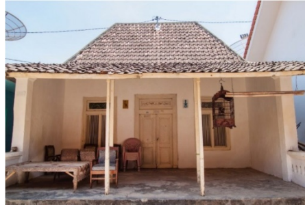
FIGURE 10. Example of Madurese Ethnic House

langgar (small mosque) in almost all houses, while the Chinese influence is seen from various sea dragon ornaments placed at the entrance of the house.