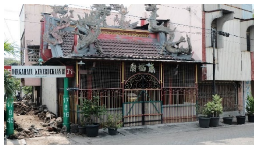
FIGURE 9. The Religious Building of Chinese Ethnic citizens in Kampung Melayu Darat

There are only a few Chinese ethnic living in Kampung Melayu Darat. Their traditional homes are rarely found because most of their homes are newly built houses. Chinese people who are living in these settlements only about 20% and some of them live in Pethek Road. They generally work as traders. Nevertheless, there is still a relic of ancient Chinese ethnic in Kampung Melayu Darat as a proof that once there was a Chinese society, that is an ancient temple (klentheng) located in Layur road.