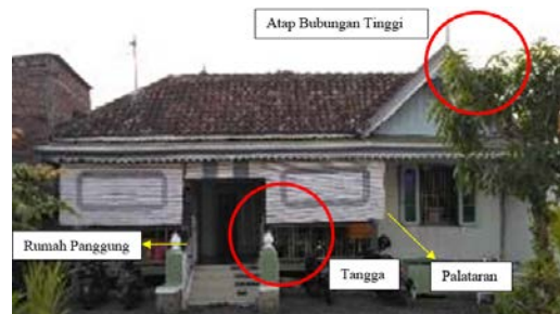
FIGURE 6. Rumah Panggung owned by one of Melayu Darat villagers

From the above characteristics, there are some Banjar houses that can be identified in Kampung Melayu Darat as seen in the picture below. Banjar House with Bubungan Tinggi type is dominantly found in this Kampung Melayu Darat. While the term Bubungan Tinggi house refers to the shape of the house itself which has a high and taper roof to form a 45-degree angle (see Figure 3.29).