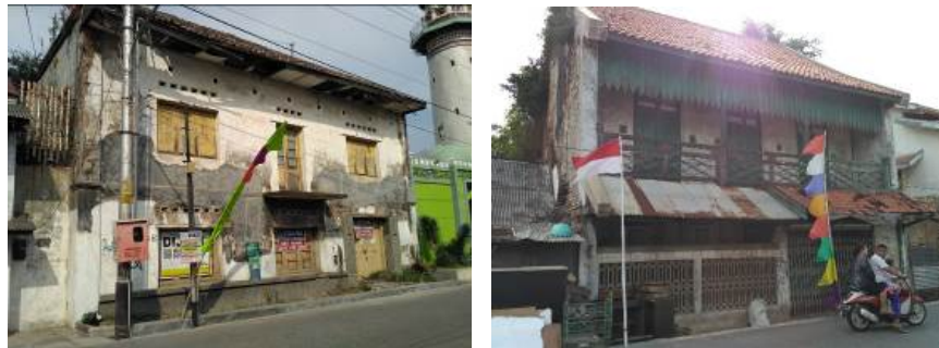
FIGURE 5. The Indische building in Layur Road

giving a grand look to the house, especially at night. The door is located right in the middle part flanked with large windows on the left and right sides. There is a large mirror with a porcelain statue laid in between the windows and doors. The Dutch, planters, priyayi and indigenous peoples who have attained higher education are classified into top societies, contributing to the spread of Indis culture through a lavish lifestyle.