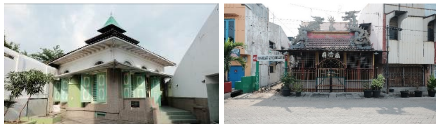
FIGURE 4. The main building of Layur Mosque and Kam Hok Bio Hok Tik Tjing Sien temple

Layur Mosque as shown above is a worship building from an Indis era, and it is known as the tower mosque. This building has been registered as a cultural heritage building since 1992. The tower was formerly a harbor monitoring tower at Indis era. Layur Mosque is one of the oldest mosques in Semarang with a great historical value. Due to the uniqueness of the building, the building with Chinese architecture is very easy to be identified, especially from characteristics of the existing styles. The hallmark of Chinese architecture is its emphasis on articulation and bilateral symmetry, which means balance. Chinese classical buildings, especially those owned by the rich are built with an emphasis on the width rather than on the height. Chinese architecture emphasizes more on the visual impact of the building width.