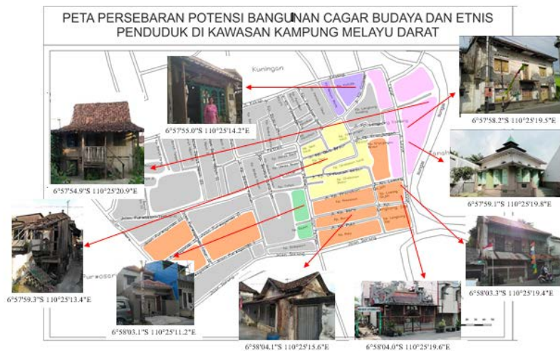
FIGURE 3. Distribution Map on potential of cultural heritage buildings in Kampung Melayu Darat

The potential of cultural heritage in Kampung Melayu area mostly takes form of heritage buildings from Indis era and these buildings are mostly found along Layur Road, Kampung Melayu Darat. These buildings are uninhabited buildings and some of them formerly used as warehouses. However, there are also buildings with cultural heritage potential in the form of worship houses, Colonial Building, and Traditional Houses of various ethnic.