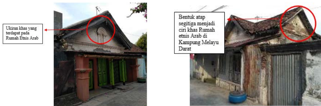
FIGURE 8. House of Arab Ethnic citizens in Kampung Melayu Darat

People of Arab ethnic also live in Kampung Melayu Darat. Most of them occupy Kampung Baru, Kampung Pulo, Kampung Lengkong Gajah, and Kampung Lengkong Sop areas. However, there are also some of them who live in Pethek Road and Purwogondo II.