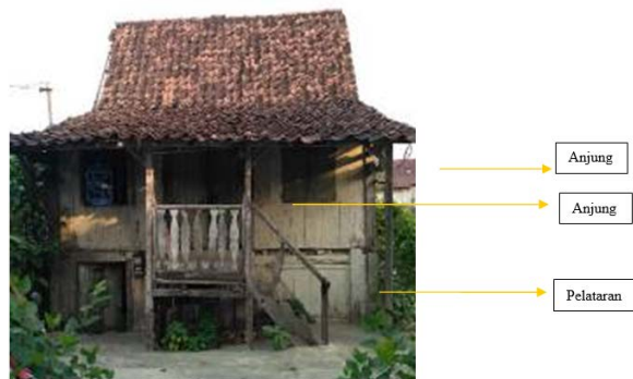
FIGURE 7. Rumah Panggung owned by one of Melayu Darat villagers

People of Arab ethnic also live in Kampung Melayu Darat. Most of them occupy Kampung Baru, Kampung Pulo, Kampung Lengkong Gajah, and Kampung Lengkong Sop areas. However, there are also some of them who live in Pethek Road and Purwogondo II.