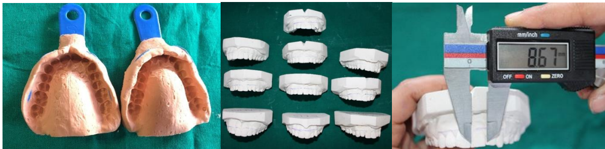
Figure 3: Diagnostic Impressions and Models were obtained