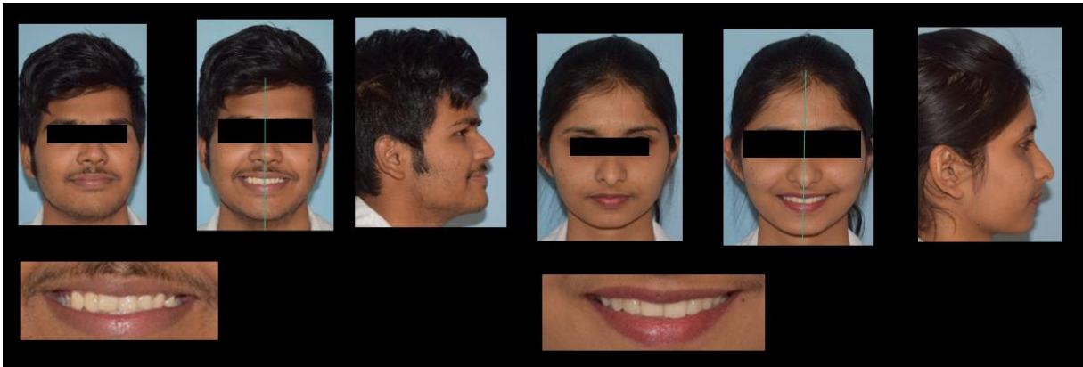
Figure 1,2: Photographs taken in frontal view, lateral view, smile at rest