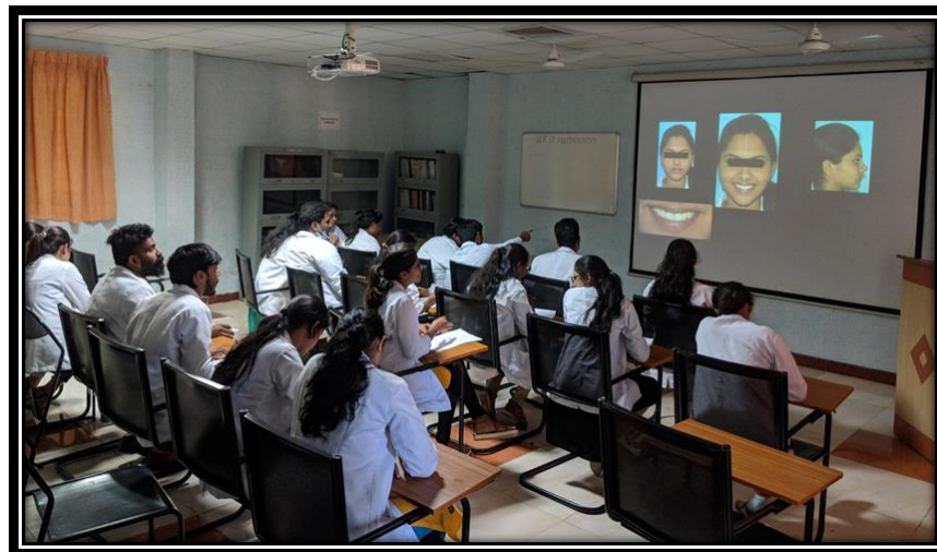
Figure 5: Questionnaire were distributed to Observers