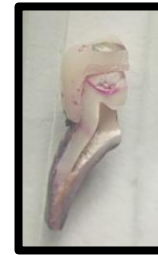
Figure 4: Microleakage Score 1 – Zirconia Crowns.