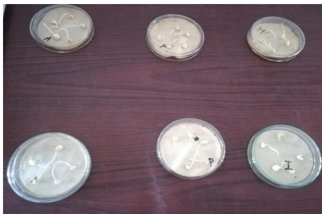
Fig 1: showing germinated varieties in aqueous extract treatment.