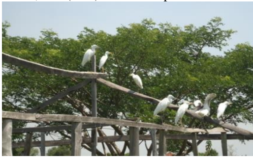
Plate 13: Bird watching Sika beach Usenge

natural attractions based opportunities for ecotourism promotion and income as opposed to fishing activities which leads to HIV/AIDS prevalence, 44 (12%) of the respondents had no