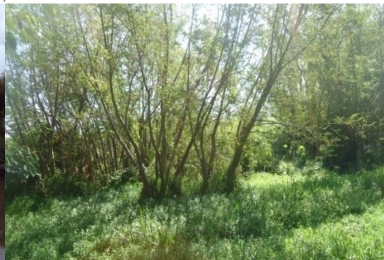
Plate 11: Nature trail- Mageta Island wetland