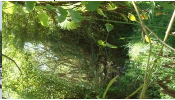
Plate 14: Mageta Island Mau Mau detainee Camp - Nature - trail

opinion, while only 15 (4%) had contrary opinion that there were natural attractions sites available for ecotourism activities which could be exploited for ecotourism activities.