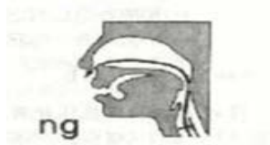
Fig 2 ng of oral cavity