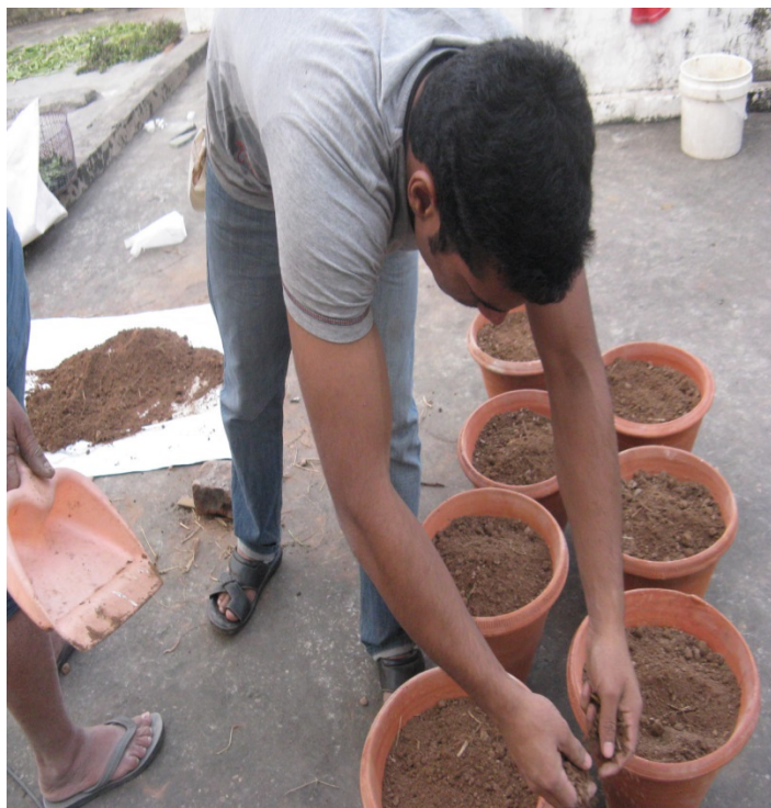
Final Soil Level in Selected Pots (Snap shot B-3)