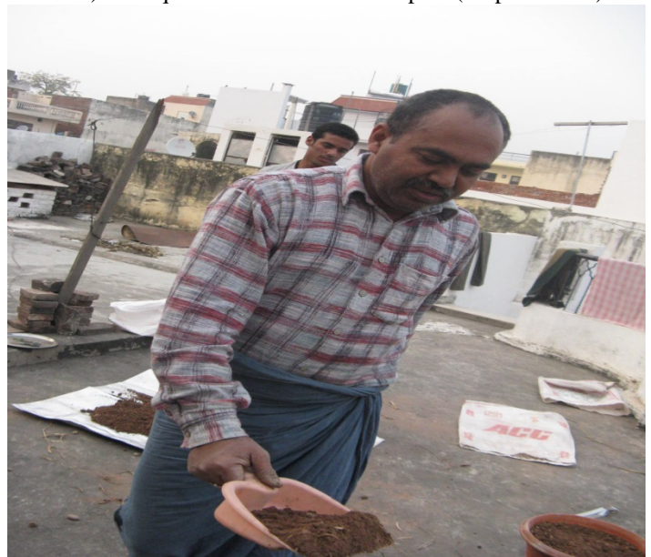
Soil loading in selected pots (Snap shot B-2)

Equal quantities of blended soil (Step A) were loaded into each pot up to similar level. Refer soil loading in Selected Pots (Snap shot B-2) and equal soil level in selected pots (snap shot B-3)