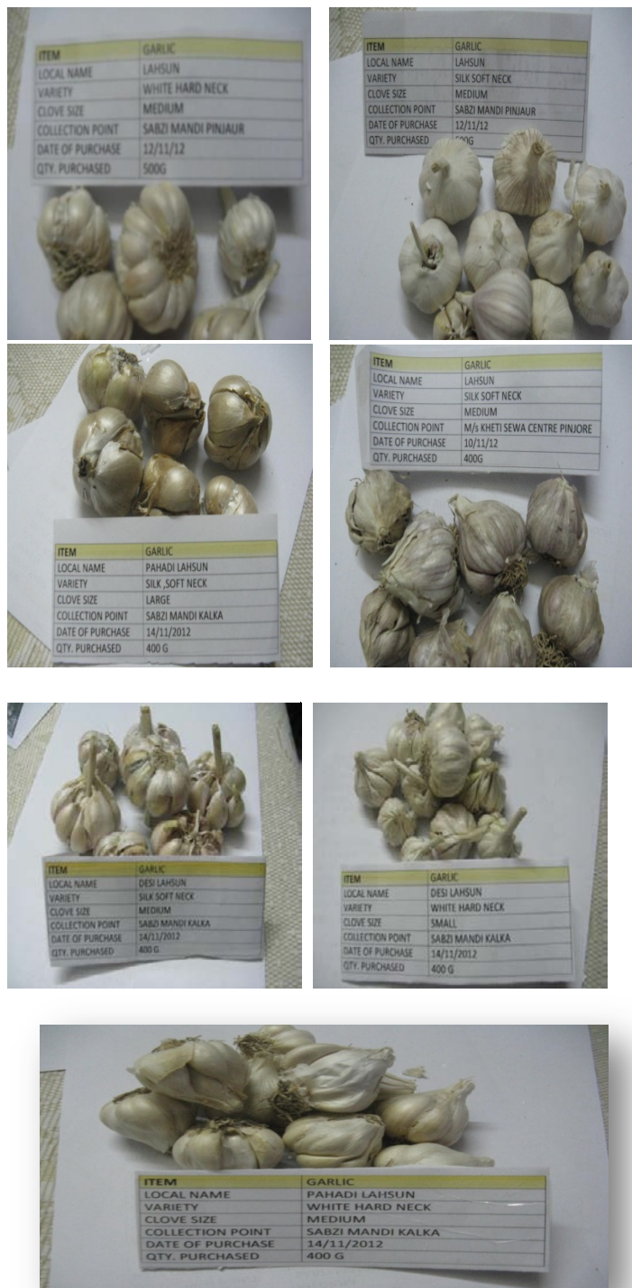
Garlic samples collected from various locations (C-1)