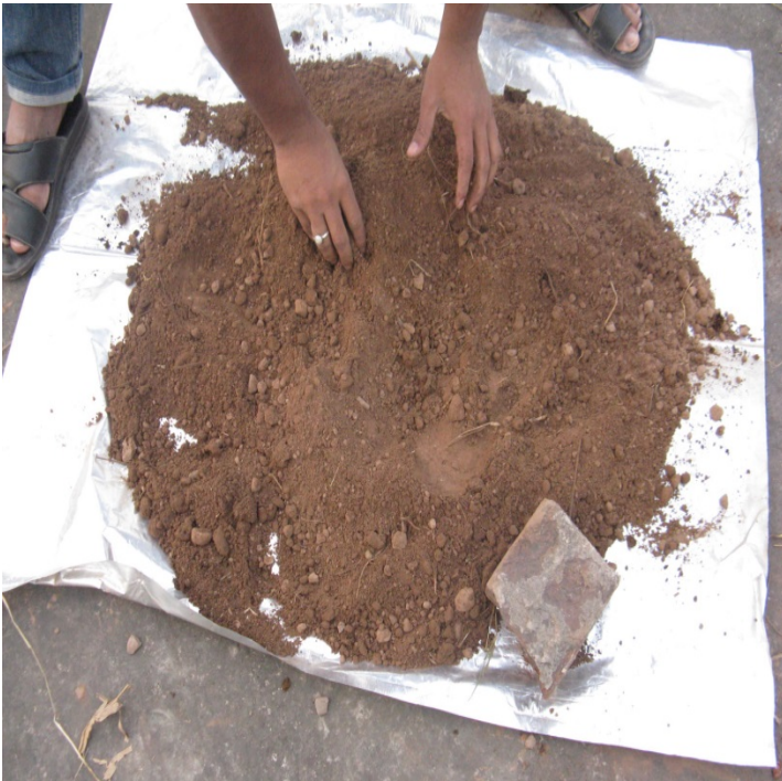
Soil Preparation snap shot A-1