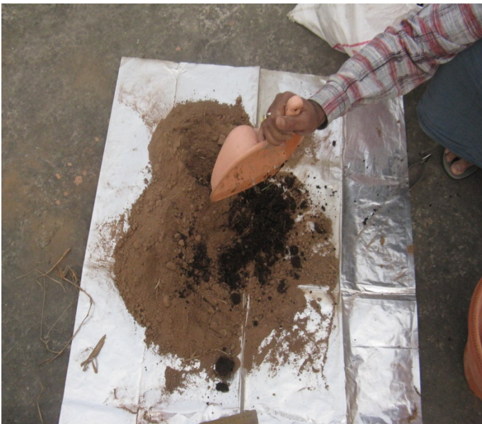
Soil Preparation Rotted Dung mixing (snap shot A-2)