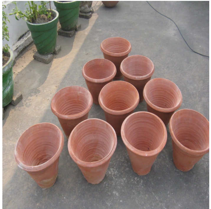
Selected Pots (Snap shot B-1)