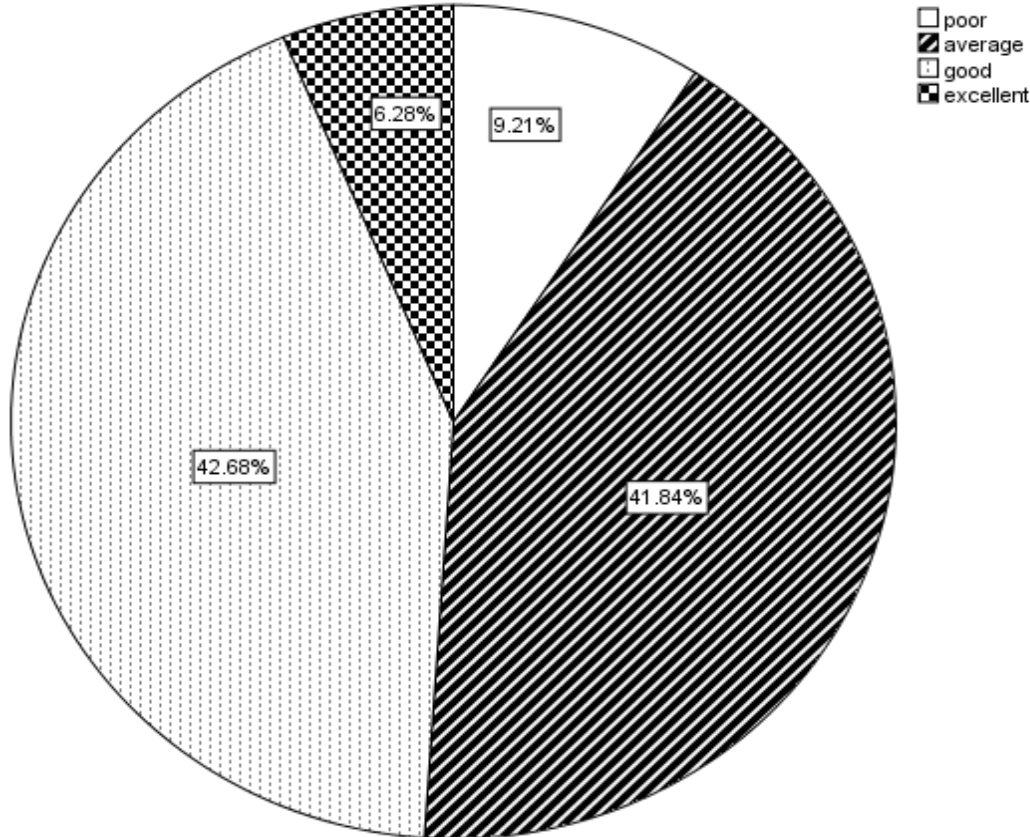
Figure 2: Extent to which families appreciated the role of Caritas in educating street children in the region.

Figure 2 shows that approximately 43% of the families appreciated the role of Caritas project in educating the street children in the region to a very great extent, at the same time 42% appreciated greatly while 6% of the population said that the projects had an excellent effect and 9% of the respondents did not appreciate the Caritas project in terms of its role in educating the street children in the region.