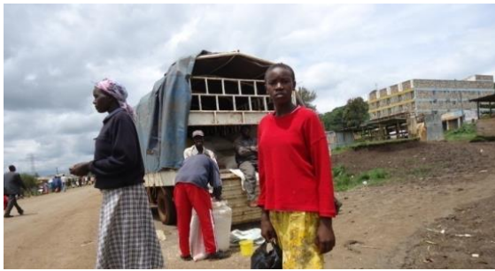
Figure 2 : A man selling dry maize.