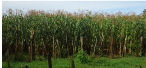
Figure 3: A ready farm for sale

The plate 4.3 shows a ten acre maize field with which the owner sold for Kshs. 60,000 per acre. Hence for ten acres, he was paid ksh.600, 000. This has attracted more farmers to sell their crops. Plate 4.2 shows the dry maize cereals sold in the neighborhood at ksh.150 per two kilo tin. This is yet another hot business. The effects of green maize commercialization is felt by the buyer and the profits are enjoyed by green maize seller. “The N.C.B.P depot is hardly 200 meters from the market at Lessos.” This was the lamentation of a farmer. ‘There are many who have passed the same misery I underwent.’ Some of the children, whose parents had not had enough maize, saw their children sent home. Secondly, there were reports of poor seed dispersion and fertilizer distribution. Importation of fertilizer was as if it was not meant for farmers since it arrived three weeks after the planting season.