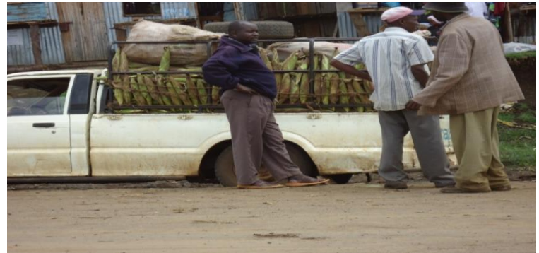
Figure 5: A pick up at market Centre

Commercialization of green maize as seen in the table shows that 51% of the entire population believed that there is acute food shortage in the county. According to the table 4.6, it would be prudent to implement a serious food security measure. Another 24 % still agree CGM has encouraged food shortage and hence led to food insecurity. However, some still believe that CGM is only blamed for the shortage. That should not be the case. The farmer has an obligation to plan for what is enough for the year.