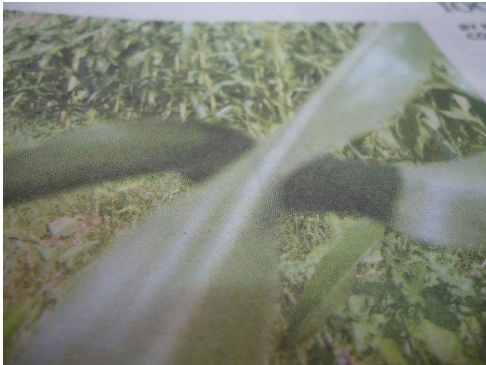
Figure 4: A clip from the nation papers

Figure 6 shows an irrigation project sponsored by the Catholic Church in Lodwar, the study saw green maize I areas like Transmara, Meru, Narok, Tanzania and Uganda The relevance of this plate to the study is to compare irrigation development in Lodwar and many other parts of the country on food security. If the scheme succeeded in Lodwar, then why not in Nandi County, in dry months? In conclusion, on expected service delivery, the Government is expected to owe up responsibility in ensuring food stability to all Kenyans.