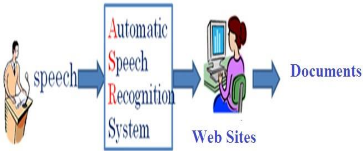
Figure 1: ASR Used for document recommendation

The system architecture shows how ASR is used for referring particular document. Speaker speak some topic through mike this voice give input to the ASR then ASR convert voice to text format. The ASR create sentences from voice this sentences used as query for searching document. But we have to go through the websites for particular document.