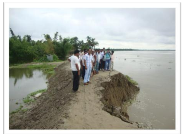
Figure 2: Breach and river erosion on the bank of river Bharamputra

District Administration was regularly monitoring the early sign of impending flood and rising water level in the rivers on day-to-day basis. Since flood is the regular phenomena in the district so it is essential to monitor the situation in advance for better preparedness. According to the rainfall in the catchment area and prediction of IMD, there was high possibility of the flood hitting the district this year, a number of necessary arrangements / exercises have been carried out i.e. identification of potentially weak areas along embankments and river banks, capacity building, quick response, early warning etc. All the potentially weak embankments were identified as vulnerable sites and mapped by the Water Resource Department (Figure 2). After identification of such sites, repair works in advance has been completed especially for the most vulnerable sits like Pazarbhanga, Manikpur etc. As a next step towards the effective flood management the District administration was done the assessment of available resources in hand and the resources required for worst case. Immediately after the warning for severe rainfall at the catchment areas and speculation of flooding of the district, a 24x7 Emergency Control Room has been established with adequate number of supporting staffs and officers.