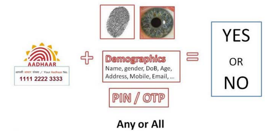
Figure 2: Authentication mechanism

In all form of authentication, AADHAAR number has to be provided so that authentication is reduced to a 1:1 match. But it does not mean that the system does not have capability to do 1:n matching. During allotment of AADHAAR number, system performs deduplication within existing data. But this 1:n facility is not extended beyond this phase.