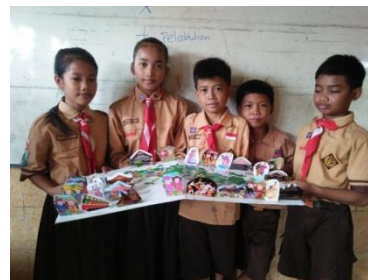
Presentation about media peta umum 3D Pop Up creativity assessment sheet which includes aspects of giving ideas, solving problems, accuracy of information and product display. The results of the observations are presented in the following table: