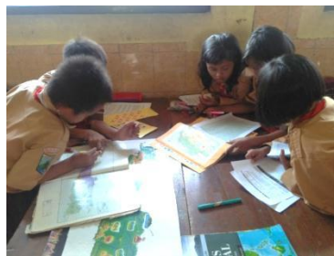
Finishing LKPD with group class