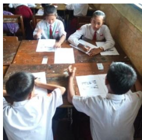
Discuss activities with group class