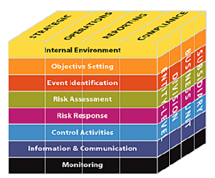
Figure 1 : COSO-ERM Dimensions

According to Soetedjo & Sugianto (2018), the COSO ERM framework has a framework of goals and components to achieve goals. The following are the objectives and components for achieving the goals based on COSO ERM, as presented in Figure 1, namely: