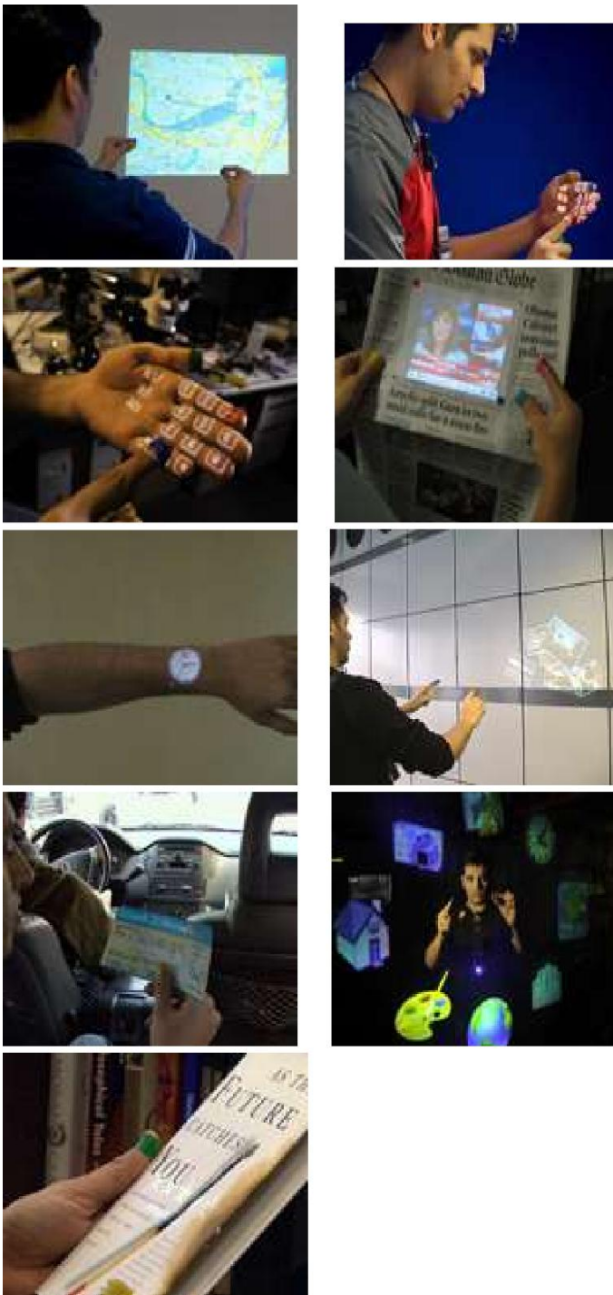
Fig 3. Example Of Commonly Used Applications

Sense uses image recognition or marker technology to recognize products you pick up, then feeds you information on those products. For example, if you're trying to shop "green" and are looking for paper towels with the least amount of bleach in them, the system will scan the product you pick up off the shelf and give you guidance on whether this product is a good choice for you. Pictures If we fashion our index fingers and thumbs into a square (the typical "framing" gesture), the system will snap a photo. After taking the desired number of photos, we can project them onto a surface, and use gestures to sort through the photos,