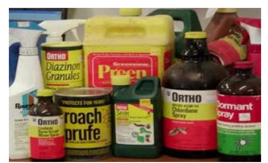
Figure 1- captured photograph of some pesticides