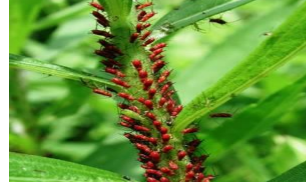
Figure 2- Captured photograph of crop affected by insects