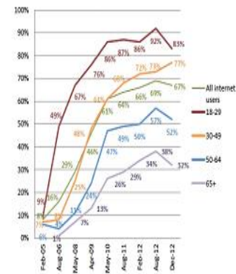
Social Networking Site Use by Age Group, 2005-2012 % of internet users in each age group who use social networking sites

Source: Pew Research Center's Internet & American Life Project surveys, 2005-2012