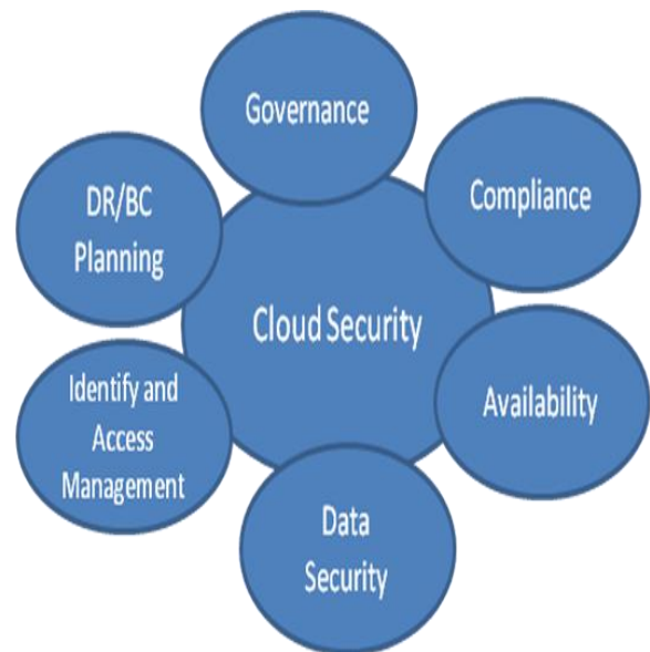
Figure 2: Measures to ensure Security in Cloud [10]

Both the organizations seeking cloud solutions and the service providers have to ensure cloud security is addressed [11]. Some of the measures to ensure security in cloud are good governance, compliance, privacy, Identity and Access Management (IAM), Data protection, Availability, Business Continuity and Disaster Recovery plans etc. The figure (fig 2) below depicts the above mentioned security measures in a snapshot: