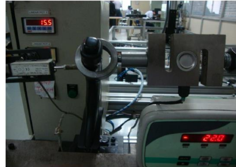
Fig.6 Initial & Final Reading set up