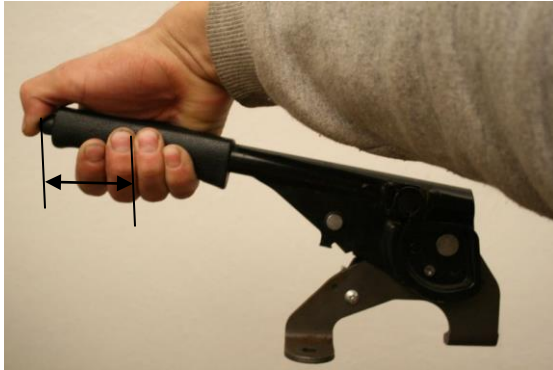
Fig.1 parking brake G'Point

There are numbers of software available which can mimic the process involved in your research work and can produce the possible result. One of such type of software is Matlab. You can readily find Mfiles related to your research work on internet or in some cases these can require few modifications. Once these Mfiles are uploaded in software, you can get the simulated results of your paper and it eases the process of paper writing. As by adopting the above practices all major constructs of a research paper can be written and together compiled to form a complete research ready for Peer review.