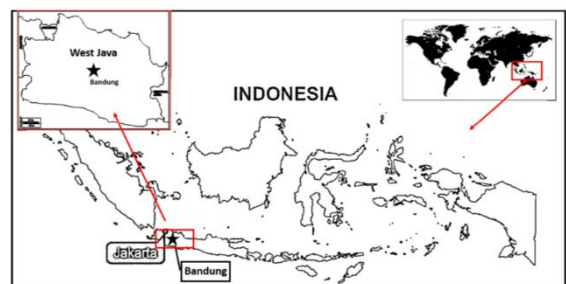
Figure 1 Bandung City in West Java Province and Indonesia

conference in 2015, and 25 mayors from Asian and African cities signed the Declaration of the Smart City, committed to the development of Smart Cities through knowledge, technology and investment. This declaration, initiated by the current mayor of Bandung, Mr. Ridwan Kamil, it is one of the efforts of government to actualize the vision of Bandung to be a good example of Smart City in Indonesia (Tarigan, et al., 2015).