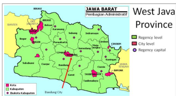
Figure 2 The position of Bandung City with its neighbouring cities and regencie