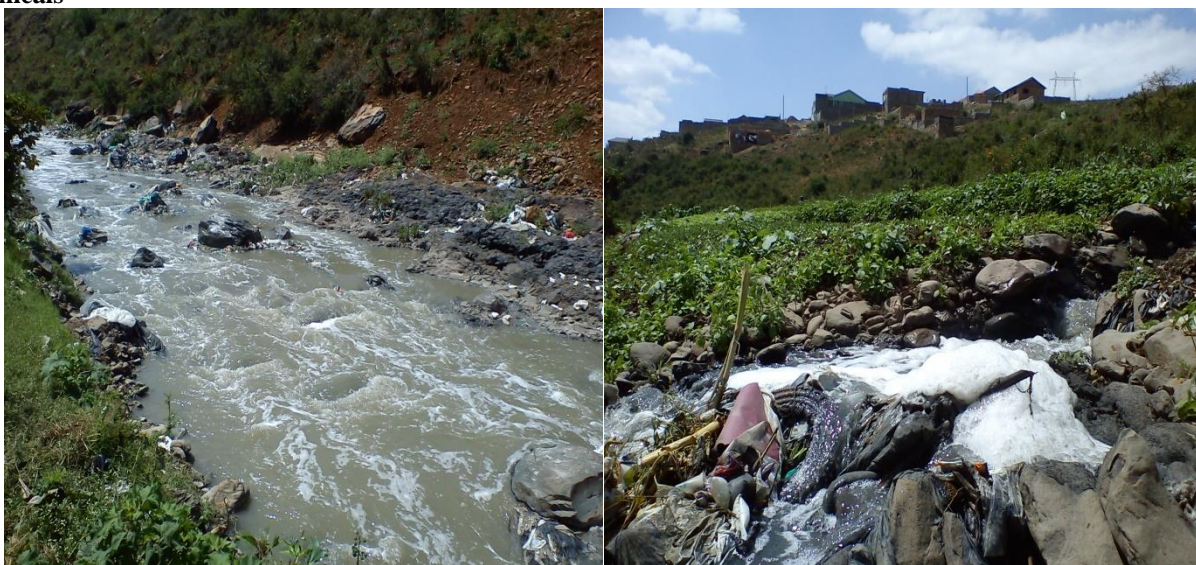
Image showing agricultural activities in a section of Nairobi