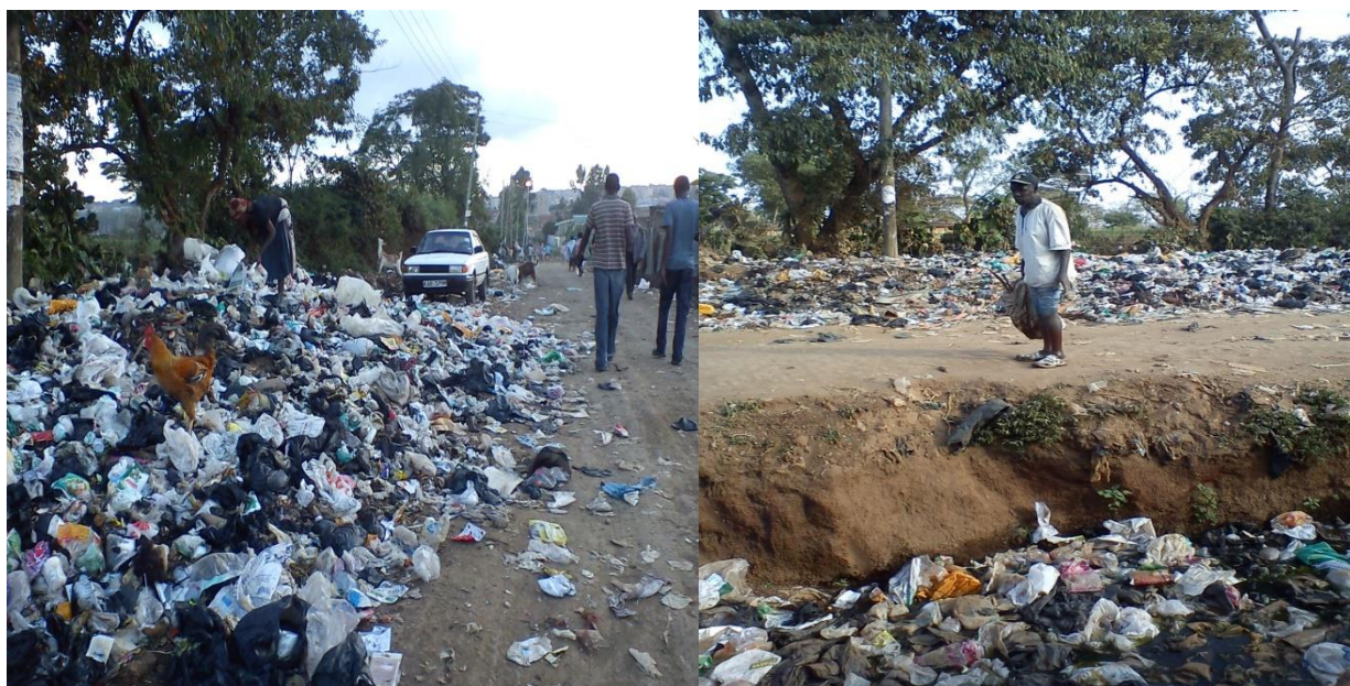
Image showing illegal dumping near Nairobi river

During the long rains early this year, there was massive flooding in the city. Few efforts had been made to mitigate the possible disaster that was looming. Despite warning from the government, people who live close to the major River declined request to vacate. The rainfall was heavy and quickly sent many waste to rivers clogging systems. The resulting flooding was responsible for a couple of deaths. People drowned and some building collapsed causing many fatalities. The government was quick to introduce a ban on single use plastics that are a very common component of solid waste. There are plans to ban plastic bottles in the near future.