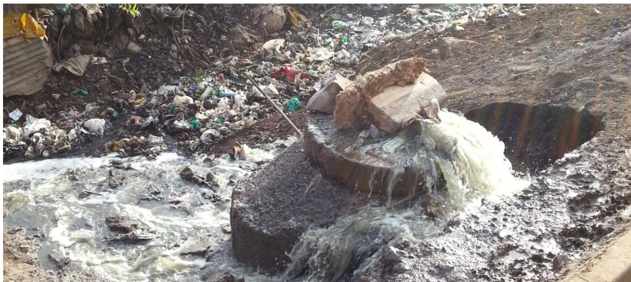
Image showing a burst sewage system

Riparian has 6,800 inhabitants. This population puts pressure on available sanitation services to the point where they end up breaking down.