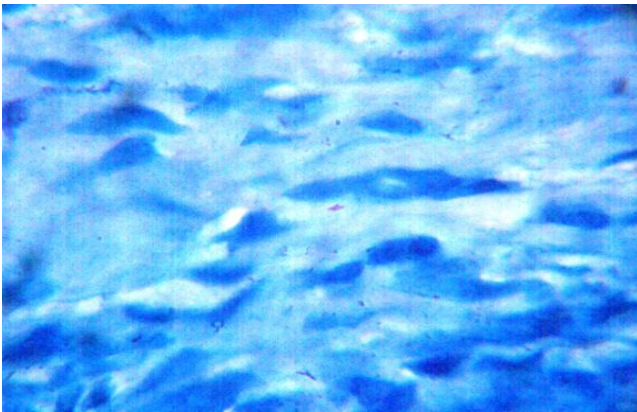
Figure 4: Modified ZN stain showing AFB (+).