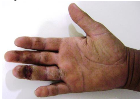
Figure 1: Clinical photograph showing trophic ulcers on fingers.

For confirmation of peripheral neuropathy, Sural nerve biopsy was performed.