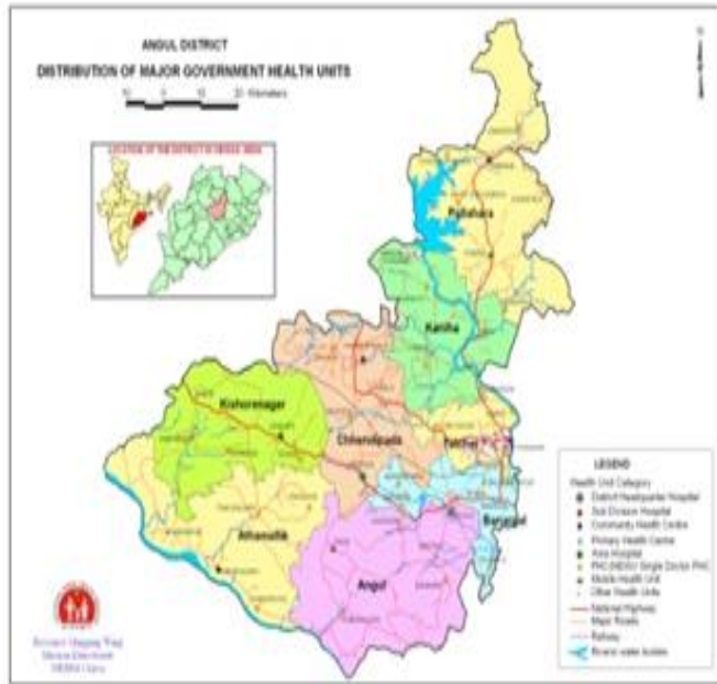
Fig-1 District Map, Angul

Malaria risk areas are mainly forest and forest fringe human settlements.5 (five) blocks out of 8 blocks contribute 90% of malaria of District.