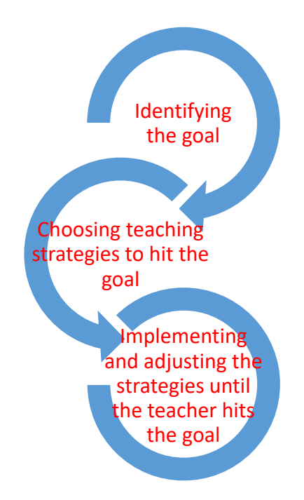
Table 1: Coaching cycle

Instructional coaching inspires teachers to grow and develop their expertise in the field. Here are some steps that may help you conduct effective coaching cycle: